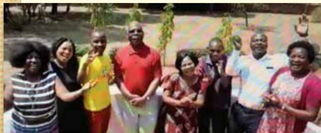
Part of the SAFE staff team in Malawi

Thank you for helping make possible these stories and impacts, both "BC" (Before COVID) and "DC" (During COVID). Please share in our joy and thankfulness.