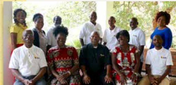
The SAFE staff in Malawi

U.S. Coordinator for SAFE & Gogo Grandmothers